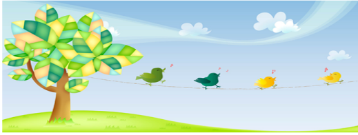
(Addendum to Health Policies/Procedures)